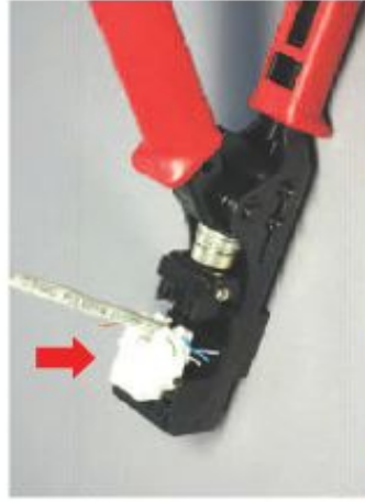
3. Put the Modular Jack into the termination tool in the right position.