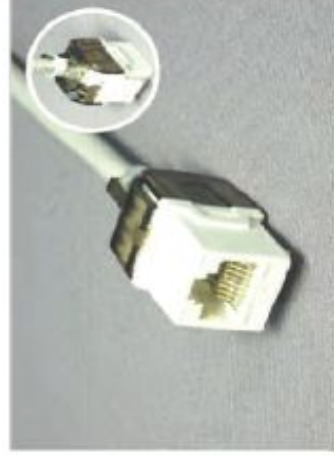
6. Place the cap & use the cable-tie to fix the cable. - Completion -