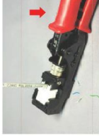
4. Squeeze the tool then terminate all wires and trim the excess wires at the same time.