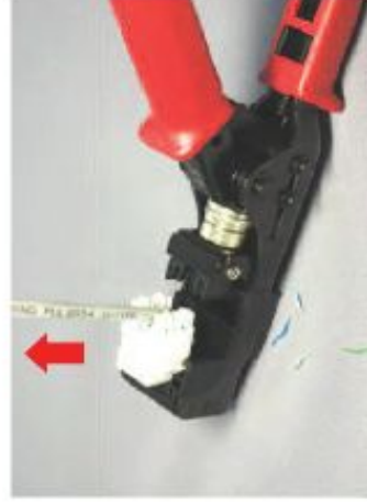
5. Remove the Modular Jack vertically away from the termination tool.