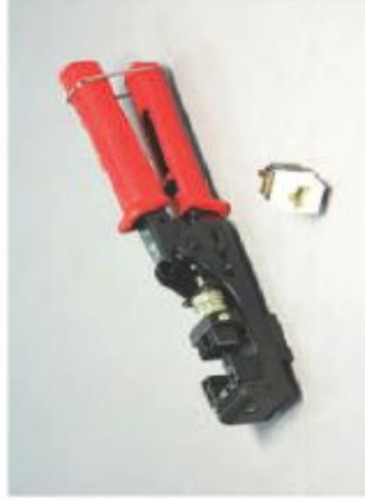
1. Prepare the EZT Tool with ERI type Modular Jack